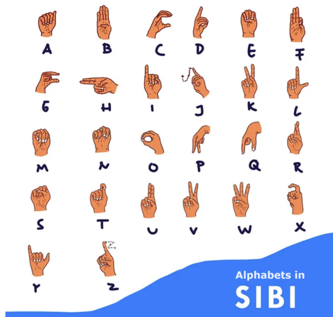
Figure 2. SIBI Alphabetic [3]

Good communication is achieved when the recipient and sender of the language both understand the message being expressed [6]. The challenge currently being faced by Indonesia is equal access and understanding of sign language among its people. Problems can arise when deaf people feel frustrated and isolated without having mediators around them which results in barriers to communication [7]. This needs to be addressed considering that every individual without exception has the right to express themselves through communication. In this era, almost everything depends on technology. One example is how technology has become the main supporting medium for communication. Unfortunately, there are no adequate communication facilities for the deaf community who use BISINDO as their main language. Therefore, the implementation of machine learning and deep learning algorithms can give a big impact through image recognition technology that can recognize BISINDO. Implementation of this model can help increase the sense of deaf people's inclusivity in modern society and achieve equality in communication for all individuals.